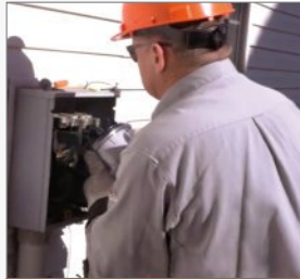
Skilled field labor and industry expertise