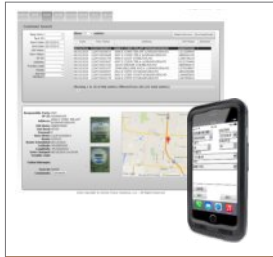
Customizable real-time work management system