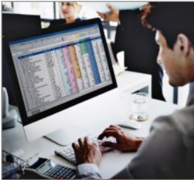
Project management services

WESCO provides turnkey, scalable meter infrastructure upgrade services across a wide spectrum of metering solutions, suppliers and scopes of work. We leverage our nationwide resources, including metering experts and local support personnel to service utilities of all sizes across North America. We are experienced in metering infrastructure upgrade project management and execution and can help to remove the pressure from utilities.