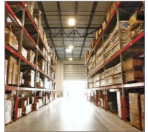
Meter warehousing, recycling and disposal