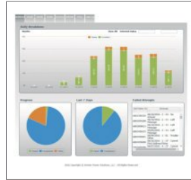
Detailed reporting and cloud storage of install data