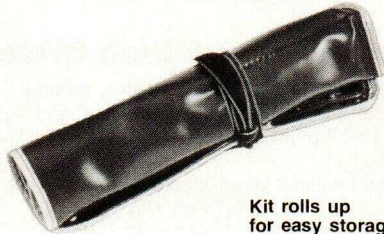
Kit rolls up for easy storage.