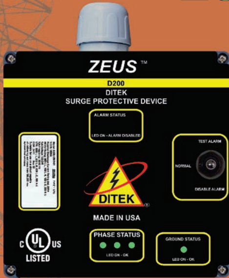
D200 Series Service Entrance