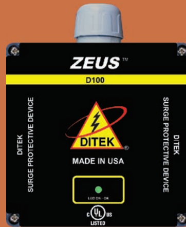
D100 Series Distribution Panel