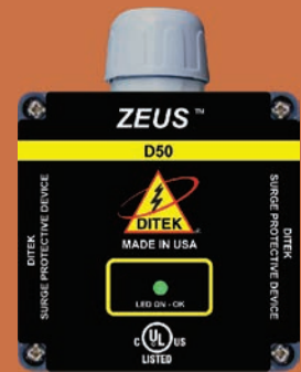
D50 Series Branch Panel/ Disconnect

DITEK's ZEUS Series industrial surge protective devices are designed to provide transient surge protection for electrical systems in the most demanding environments. Each model incorporates the latest in surge protection technology for maximum performance and protection. Available in a wide range of voltage configurations, ZEUS products are an excellent choice for electrical system surge protection.