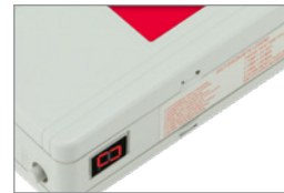
Numeric Indicator for dependable visual status and fault detection. Only available with G2-NI option.

Illumination: Long-life, high-intensity, red or green LEDs Housing: Rugged, injection-molded UL 94 5VA flame-retardant, high-temperature thermoplastic housing Input: 120/277VAC dual primary, 60Hz Battery: Maintenance-free NiCad battery Run Time: UL Listed 90 minute emergency run time, 24 hour recharge time Legend: Fully-illuminated 6" characters with 3/4" stroke and field-selectable directional chevrons Mounting: Ceiling, end or wall mounted, canopy included Finishes: Black or White Options: 2CI = 2 Circuit Input 220 = 220VAC, 50Hz Input G2 = Self-test/Self-diagnostics G2-NI = Self-test/Self-diagnostics with Numeric Indicator and Battery Access Door USA = Meets Buy America Requirements Certifications: UL Listed for Damp Locations and meets or exceeds the following: NEC requirements and NFPA 101. California Energy Commission (CEC) compliant Warranty: Any component that fails due to a manufacturing defect is guaranteed for five years with a separate five year prorated warranty on the battery. The warranty does not cover physical damage, abuse or instances of uncontrollable natural forces. See the full Exitronix warranty document for detailed information.