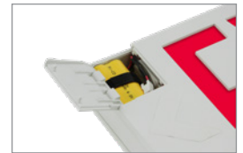
Tool-less hinged door for easy and safe access to isolated low voltage battery compartment. Only available with G2-NI option.