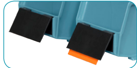
Kanban Extended Label Holder with orange flag to show bin needs restocked (see page 20)