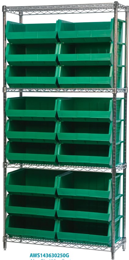
AWS143630250G AkroBin Wire System