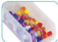
Crystal clear length dividers