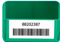
Large front label slot for easy coding and scanning