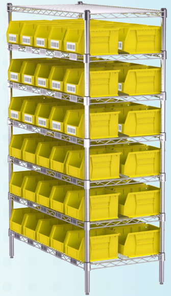
New 30237 fits perfectly on 18" deep shelving for a two-bin Kanban system