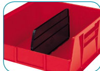
Lengthwise dividers keep items separated