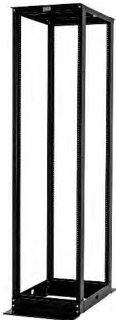
Not intended for rack-mount servers